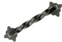
Twisted Pull Handle

Width: 2 7/8" Length: 4 3/4" • Ring Diameter: 3 1/4"