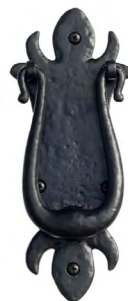
Swing Door Knocker