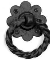
Floral Ring Handle

Backplate Diameter: 3 3/4" Length: 5 5/8" • Ring Diameter: 3 3/4"