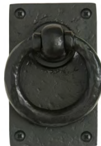
Traditional Ring Handle

Width: 2 7/8" Length: 4 3/4" • Ring Diameter: 3 1/4"