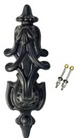
Artisian Door Knocker

Do you yearn for a rustic aesthetic of your garage doors? Look no further! Timberlane's door knockers are guaranteed to elevate your home.