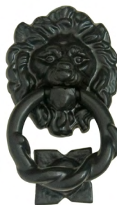
Lion Head Door Knocker

Width: 4 5/8" • Length: 5 1/8" Ring Diameter: 2 1/2"