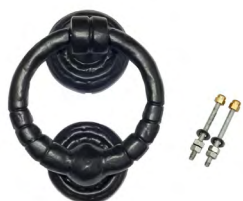
Ring Door Knocker

Width: 4 5/8" • Length: 5 1/8" Ring Diameter: 2 1/2"